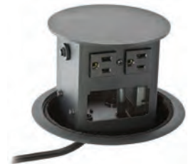
WSBH42U with WSBHTRBK