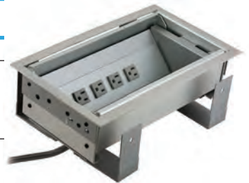
WSBG43USV (cover doors shown open)